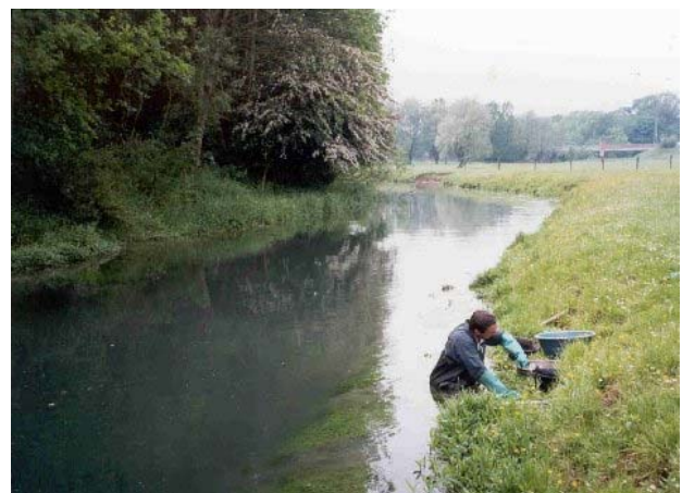
“The views expressed in this newsletter are purely those of the writer and may not in any circumstances be regarded as stating an official position of the European Commission”